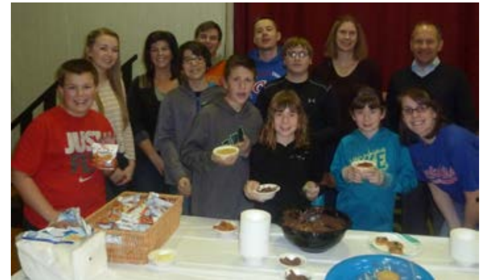
Above: The Youth and Preteens at Cripus Attucks. Bottom left and right: FAITH TANKK fun.

James 4:2 says, "You do not have because you do not ask God." So instead of thinking "When all else fails, pray," try this: "Pray before all else fails."